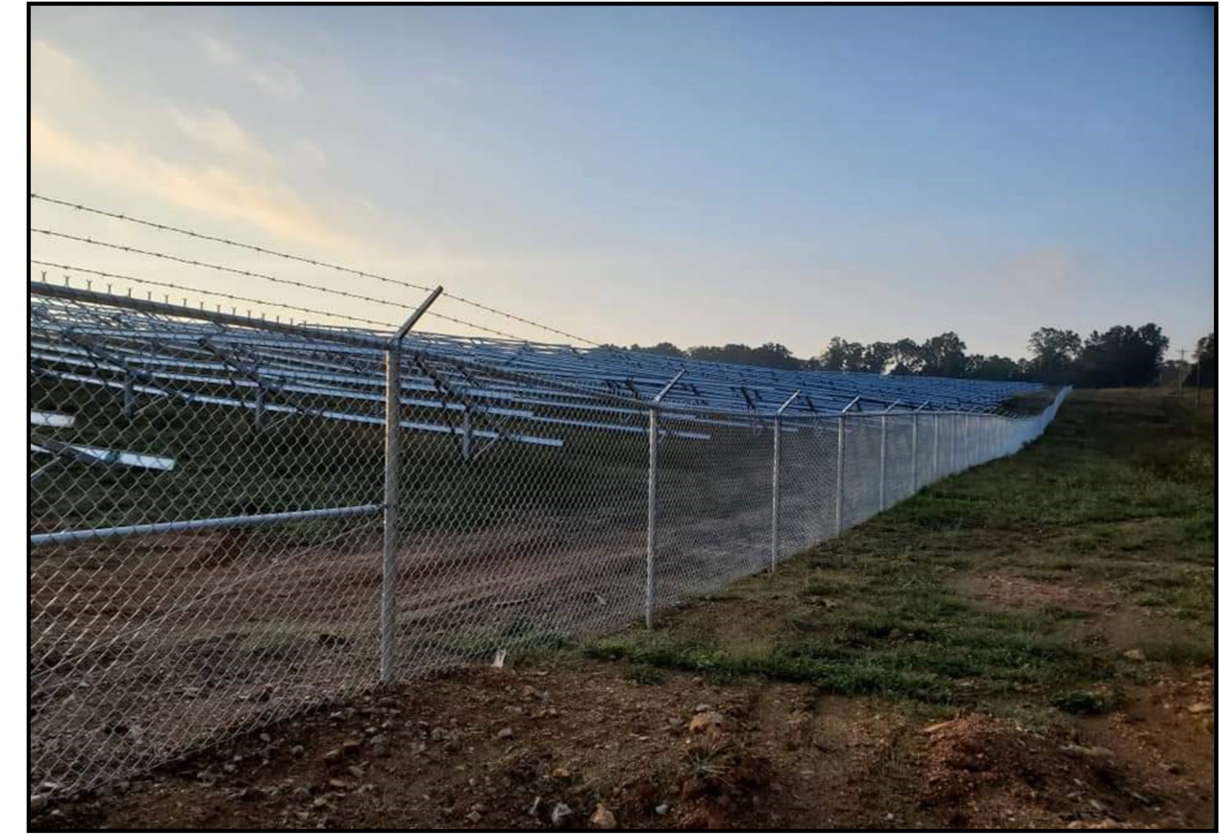
TYPICAL 8 FOOT SOLAR ARRAY FENCING