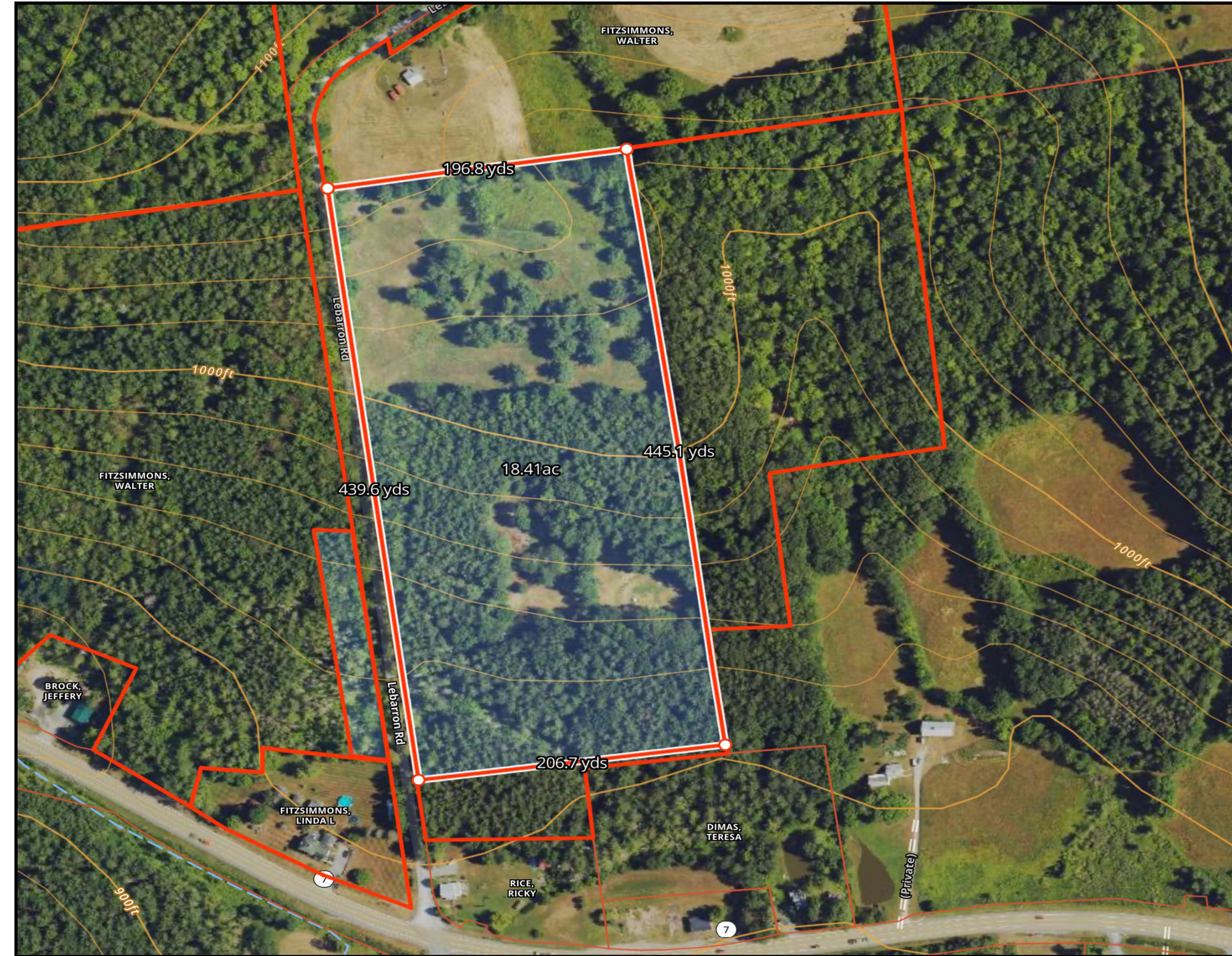
18.41 ACRE FENCED IN ARRAY AREA